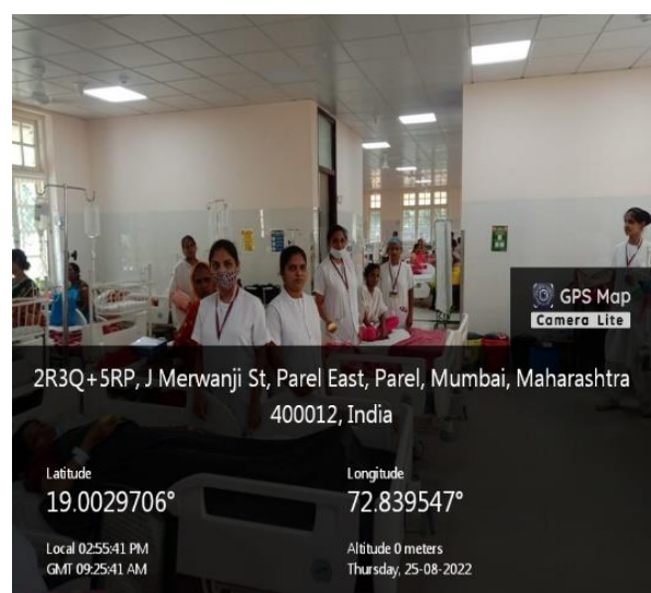
2R3Q+5RP, J Merwanji St, Parel East, Parel, Mumbai, Maharashtra 400012, India