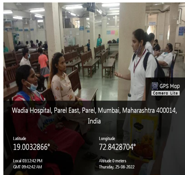
Wadia Hospital, Parel East, Parel, Mumbai, Maharashtra 400014, India

Altitude -55.9 meters Thursday, 25-08-2022