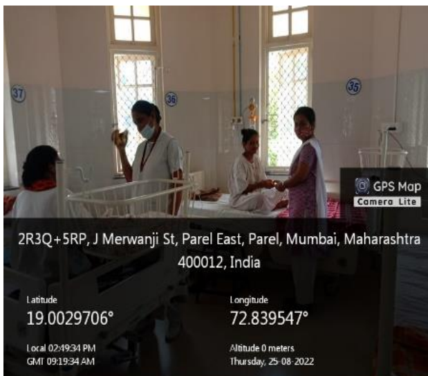
2R3Q+5RP, J Merwanji St, Parel East, Parel, Mumbai, Maharashtra 400012, India