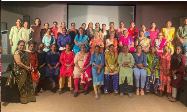
Pic 23: Glimpses of Valedictory session.