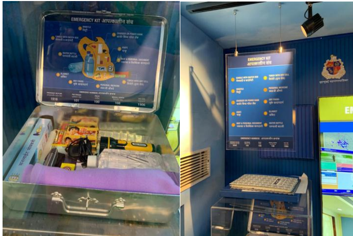
Pic 11: Emergency kit to be kept ready at home.