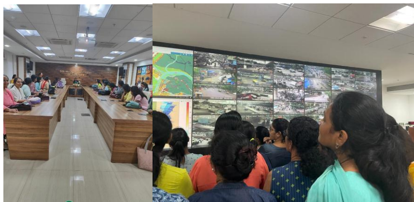
Pic 7: Visit to “Disaster Management Control Room” BMC HQ