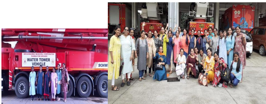
Pic 6: Visit to “Integrated Command & Control Center” Mumbai Fire Brigade.

Post lunch, all the delegates were taken “ Integrated Control & Command center ” of Mumbai Fire Brigade head quarter at Byculla. Delegates were given orientation of command center by fire officer. And explained about how the system is activated once MFB receives the call about fire and other emergencies, how the verification of call is done and how the local fire brigade is informed by control room and required help is dispatched immediately.