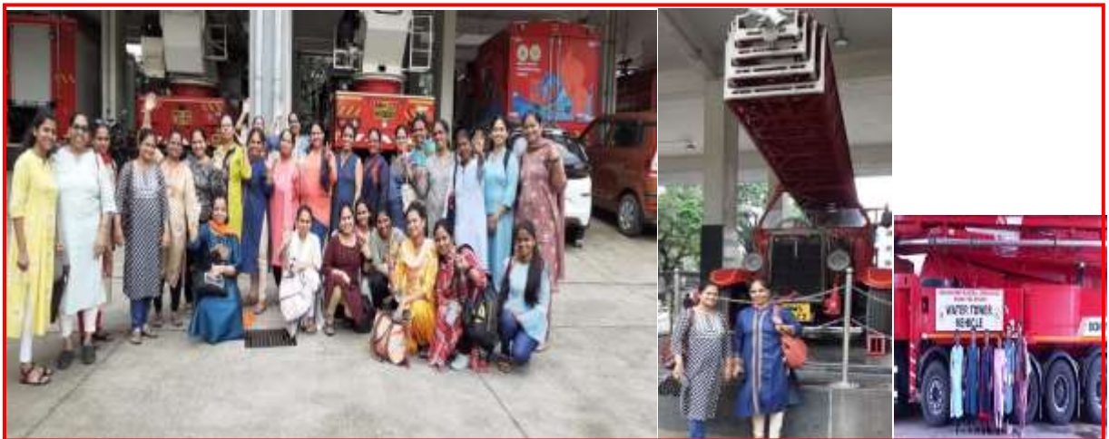
Pic 6: Visit to “Integrated Command & Control Center” Mumbai Fire Brigade.

Post lunch, all the delegates were taken “ Integrated Control & Command center ” of Mumbai Fire Brigade head quarter at Byculla. Delegates were given orientation of command center by fire officer. And explained about how the system is activated once MFB receives the call about fire and other emergencies, how the verification of call is done and how the local fire brigade is informed by control room and required help is dispatched immediately.