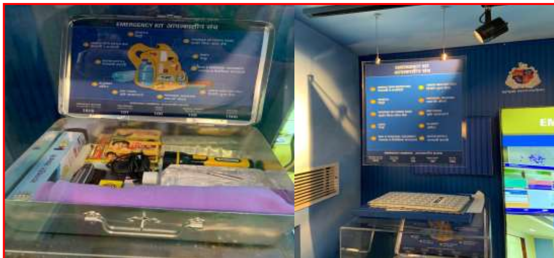
Pic 11: Emergency kit to be kept ready at home.

Visit to gallery at CIDM was arranged for delegates, where they were shown the various types of disasters in simulation form earthquake tectonic plates movement, cyclones, CBRNE disasters etc. finally what emergency kit to be kept ready at home was demonstrated.