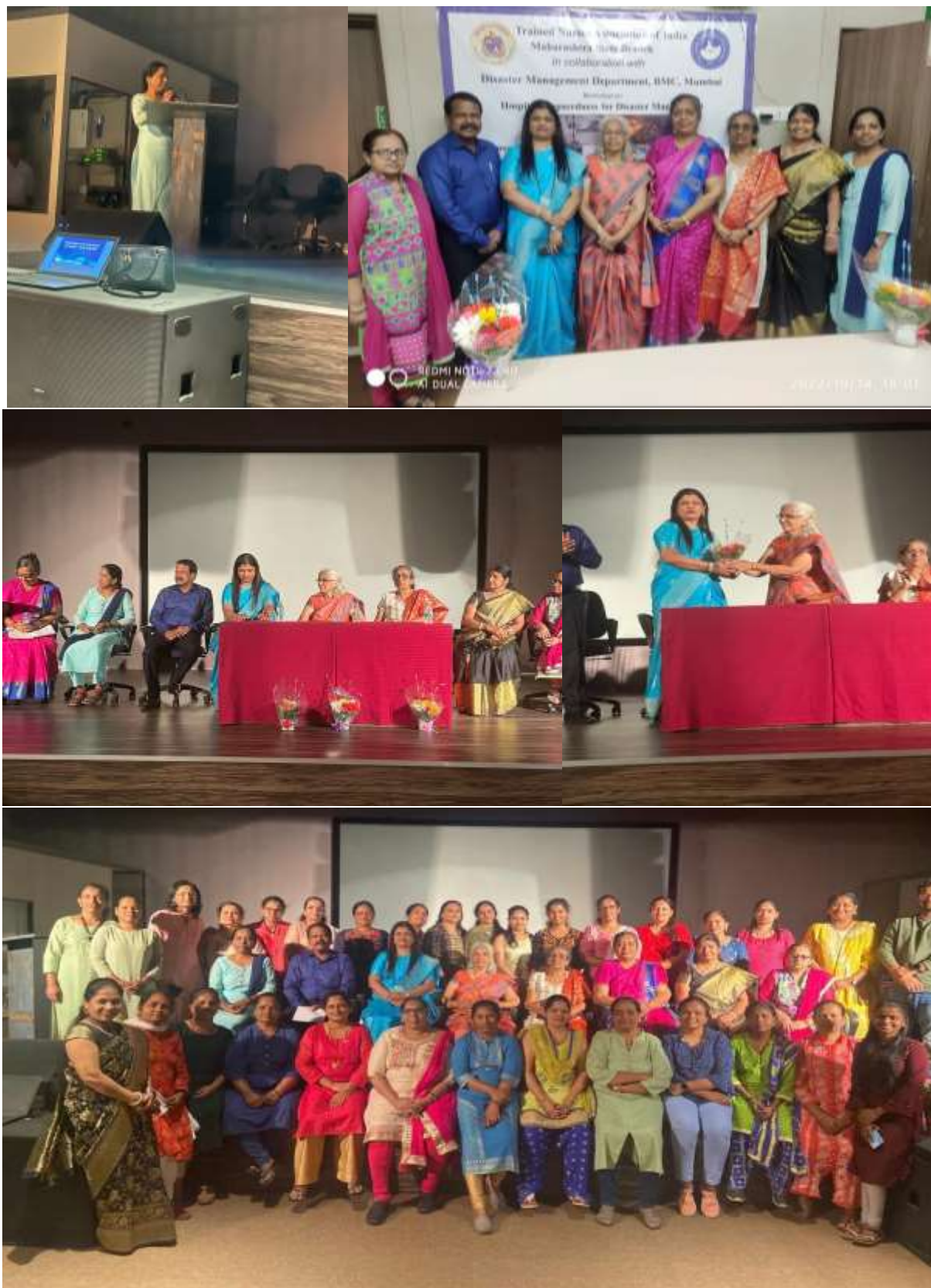
Pic 23: Glimpses of Valedictory session.