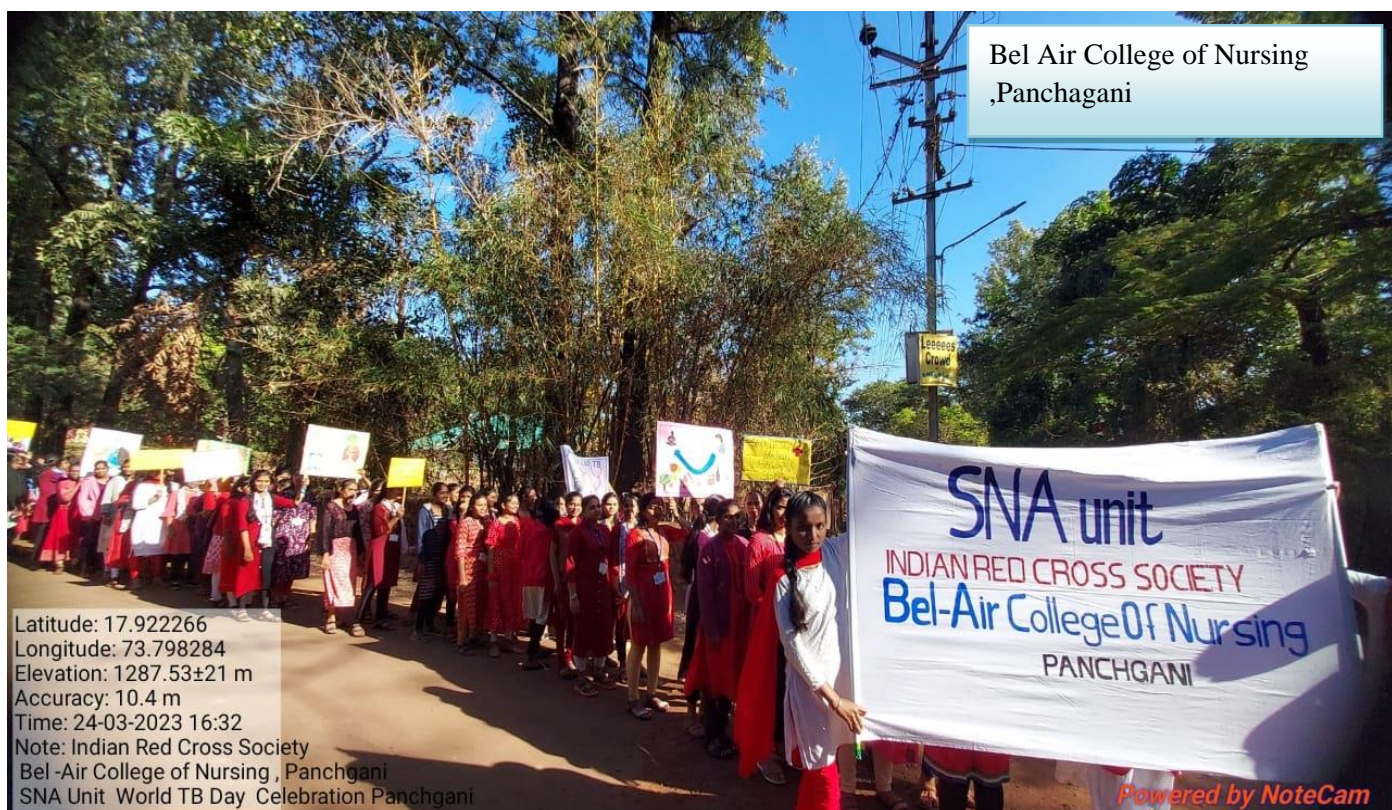
Bel Air College of Nursing ,Panchgani

Latitude: 17.922266 Longitude: 73.798284 Elevation: 1287.53±21 m Accuracy: 10.4 m Time: 24-03-2023 16:32 Note: Indian Red Cross Society Bel -Air College of Nursing , Panchgani SNA Unit World TB Day Celebration Panchgani