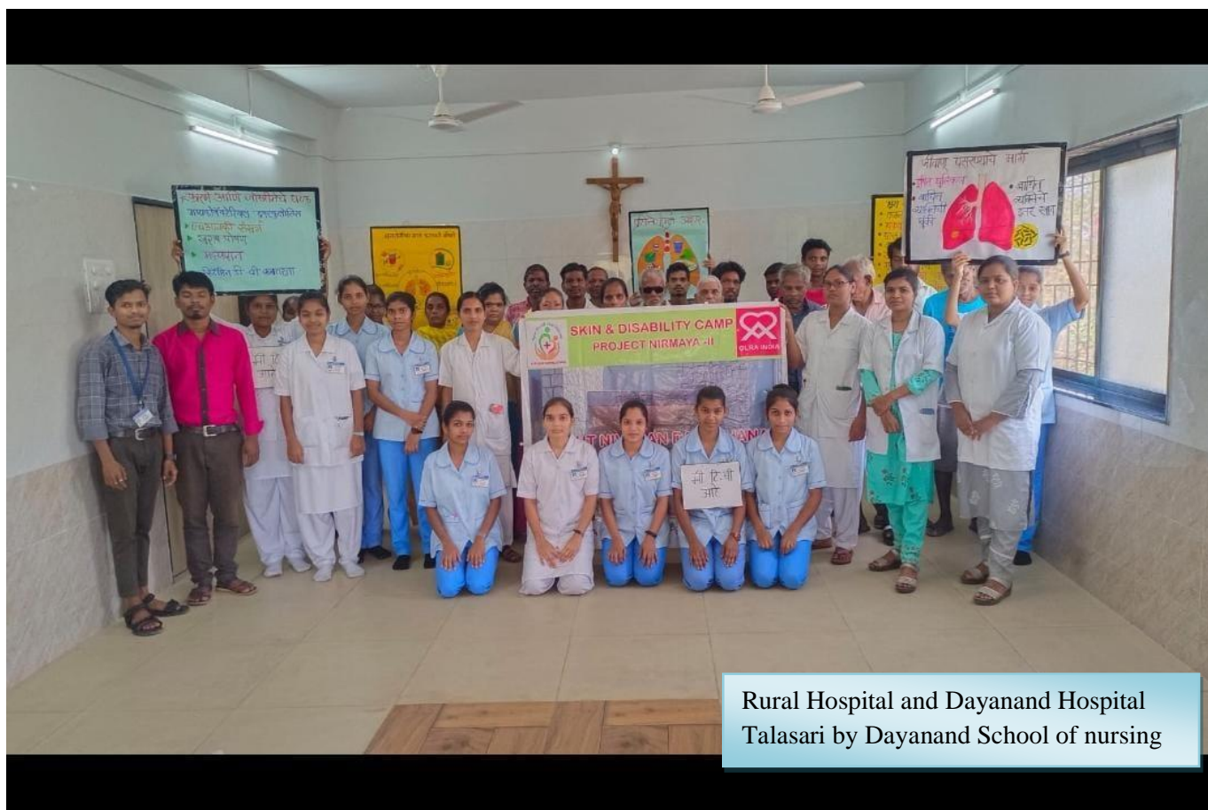
Rural Hospital and Dayanand Hospital Talasari by Dayanand School of nursing