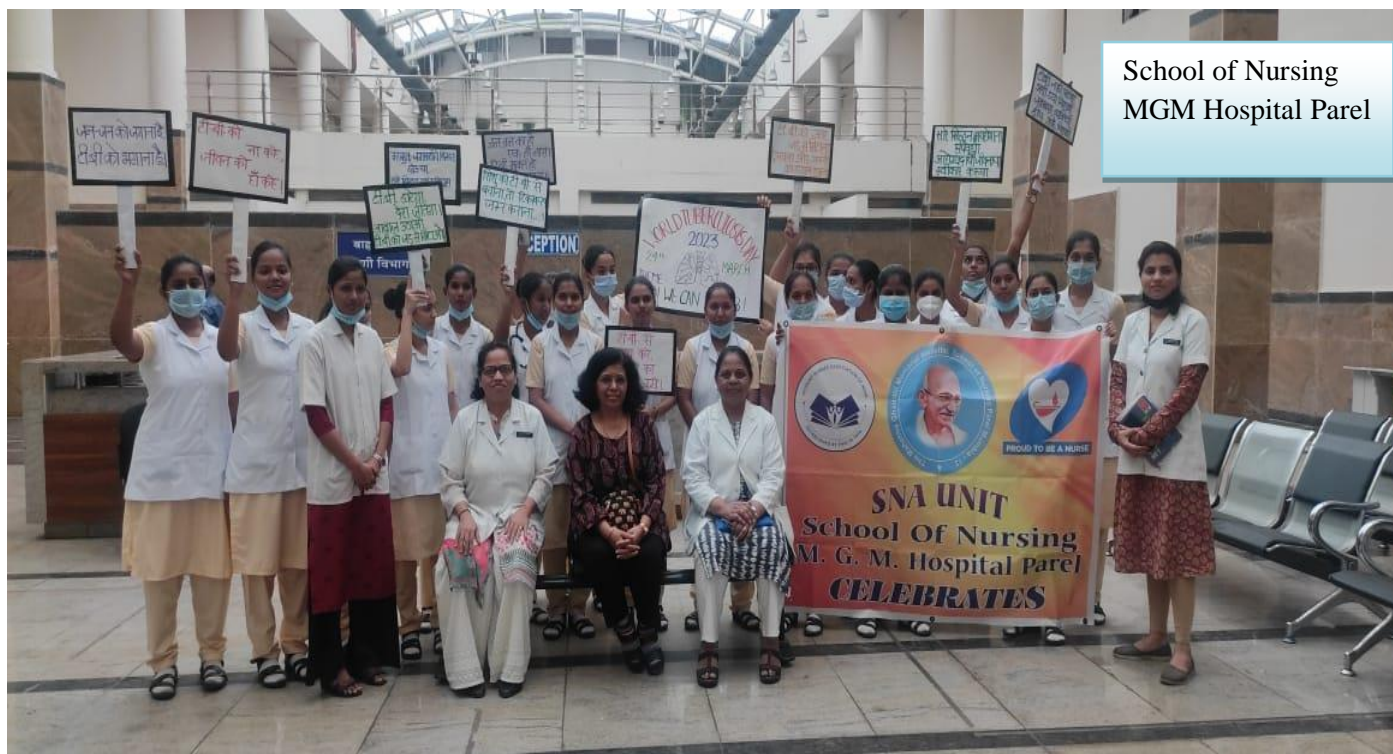
School of Nursing MGM Hospital Parel