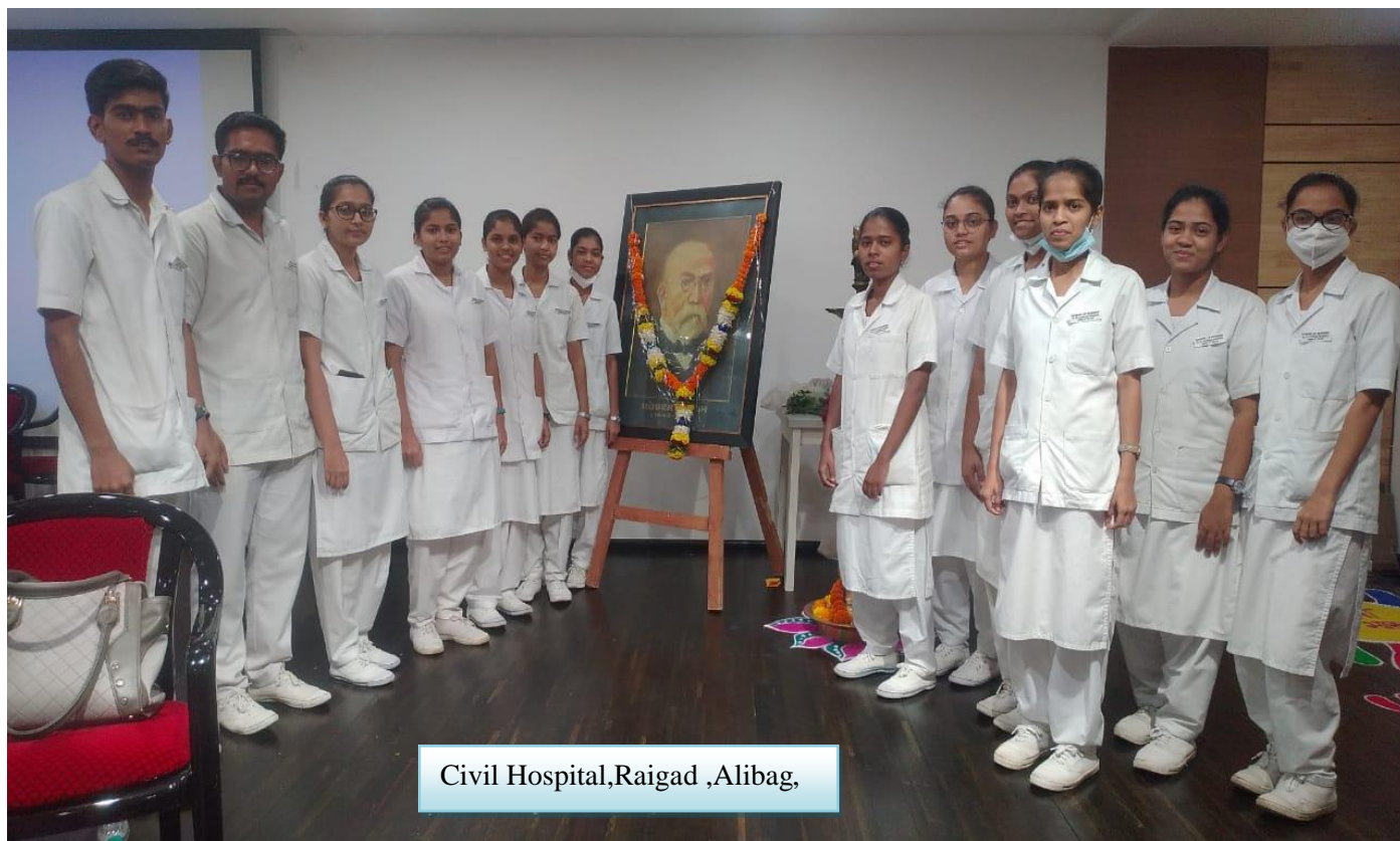
Civil Hospital,Raigad ,Alibag,