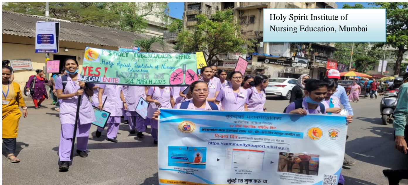
Holy Spirit Institute of Nursing Education, Mumbai